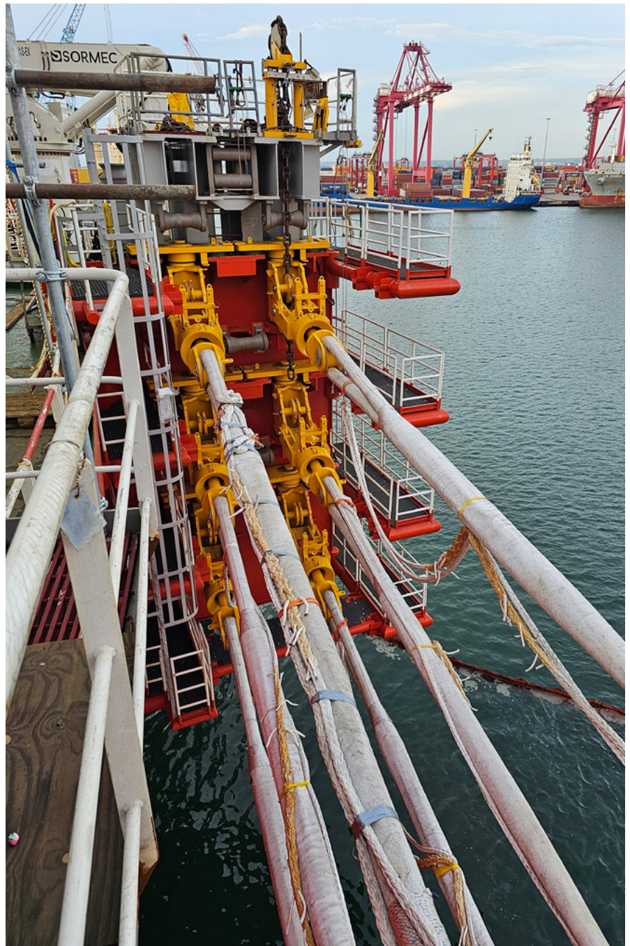
BarMoor™ Quick Connectors with Moveable Chain Jack Installation

Mooring decisions should not be left until after other decisions are made. They