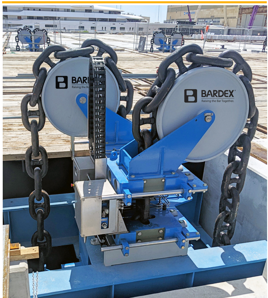
Chain jacks have been trusted to lift vessels since 1967.

Using locally produced concrete increases the local content of the project.